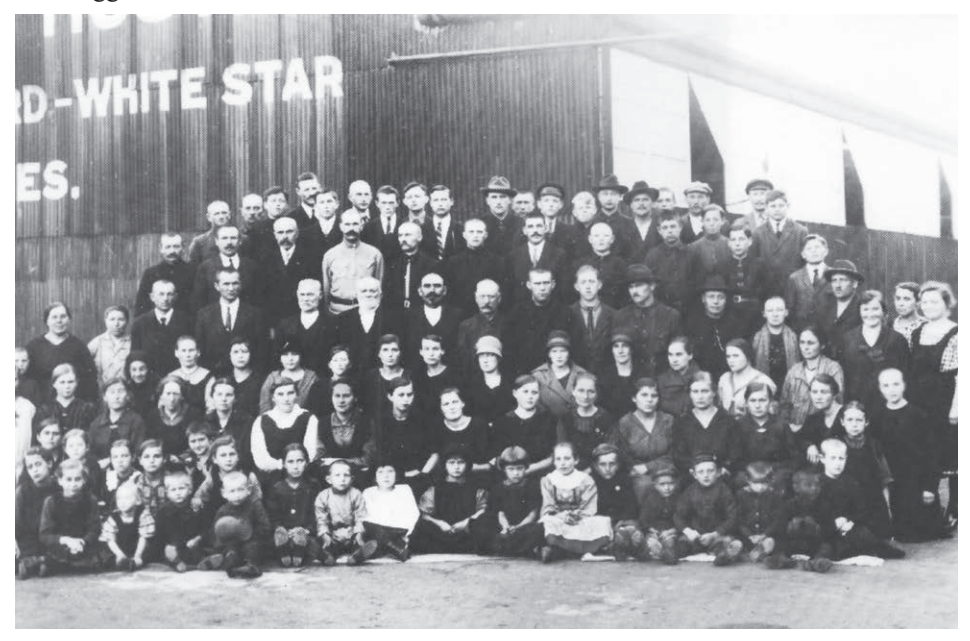
Russian Mennonite Emigrants detained for health reasons at Atlantic Park Hostel in England, 1926.

Very soon after the family's arrival in Manitoba, Peter began to pursue the hope of bringing his son over. The immigration laws were unfavourable for seriously ill