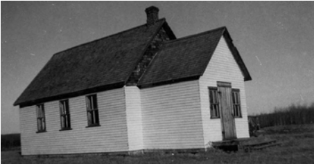
Bluebird Mennonite Church, Mayfair, SK

was also deacon of the church. The adults also contributed with four-part Zions Lieder songs. They really enjoyed singing and were good at it. The congregation sang the beloved Evangeliums Lieder .